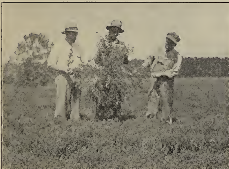
Showing a single plant and thick growth of Korean Lespedeza